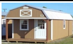
Cabin Lofted Barn with a porch to touch up your storage solution. Incl. 9 lite door and 3 windows