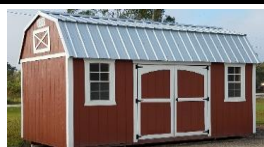
SIDE Lofted barn - our flagship model. For beauty, detail & the country look!