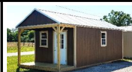
Cabin LOFTED Shed - Like cabin except Steeper roof and loft - Incl. 9 lite door & 3 windows