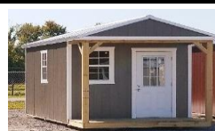
Cabin Shed -Exciting storage 10&12ft Incl. 9 lite door & 3 windows; 8ft incl 1-door & 1 window