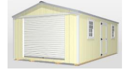
Garage Shed includes 1 8ft wide rollup door, 1-3ft wooden door and 2- windows