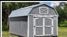
Lofted barn is unmatched beauty, detail and the country look!